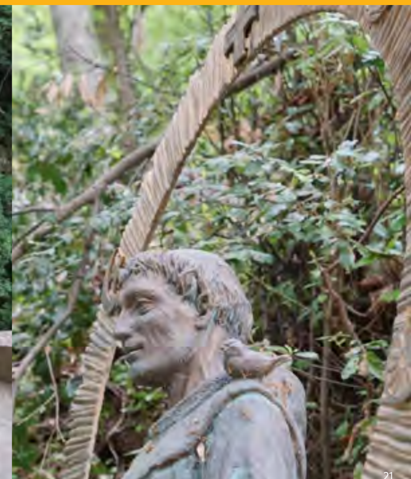
St Francis' hermitage. No mystery why he often came to this peaceful place to pray and meditate