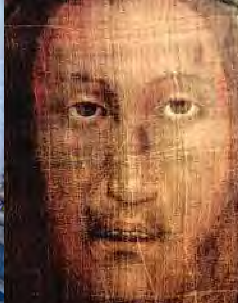
Holy Face of Manoppello