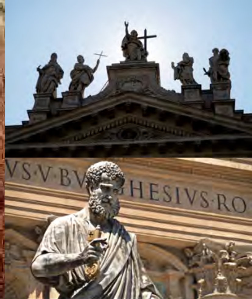
St Peter the Apostle