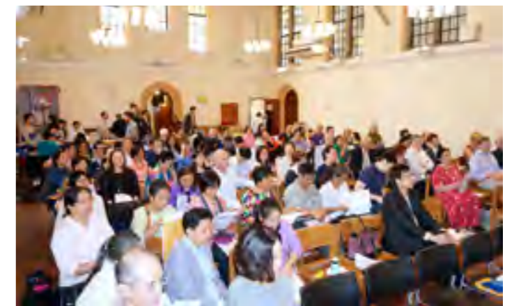
Attendees at the April 2015 Annual Church Meeting