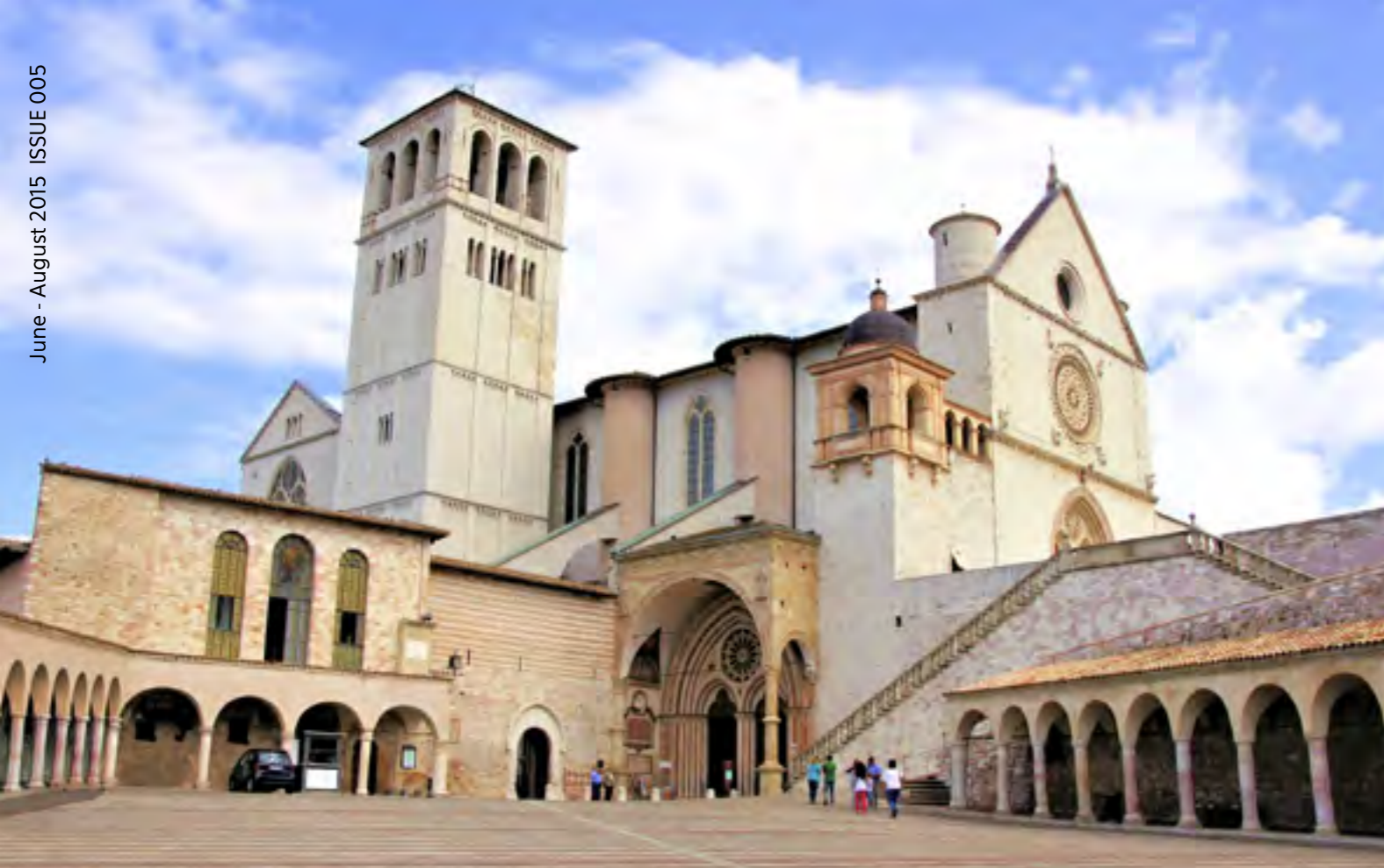
The magnificent hillside Basilica of St Francis of Assisi