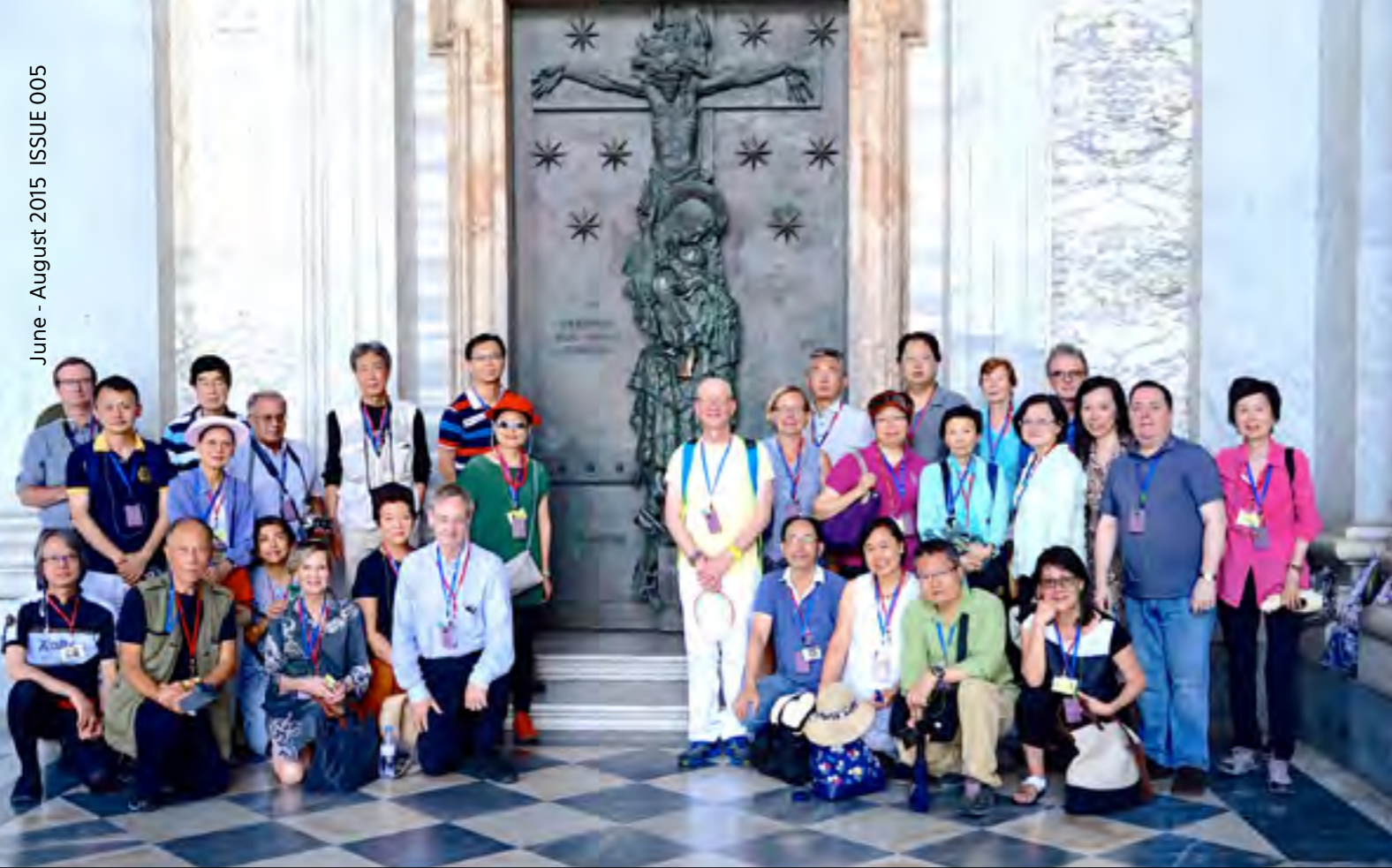
The Pilgrims outside the Holy Door of St John Lateran Basilica, Rome